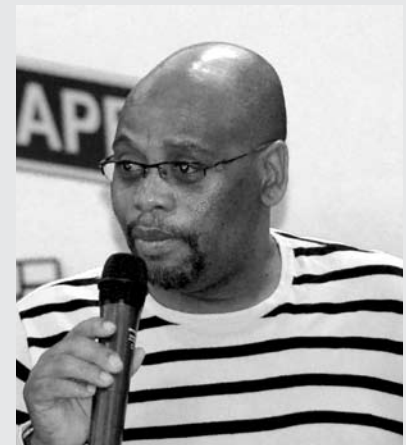
Cosatu President S'dumo Dlamini chairing the summit session on newsroom transformation