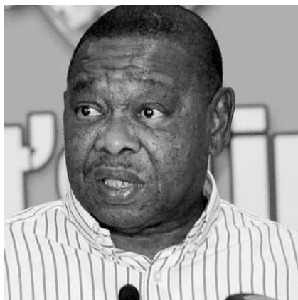
SACP GS Blade Nzimande: opening the summit

He referred to "the startling extent to which South Africa's media is concentrated in so few hands. Defined broadly, we have the most concentrated media own-