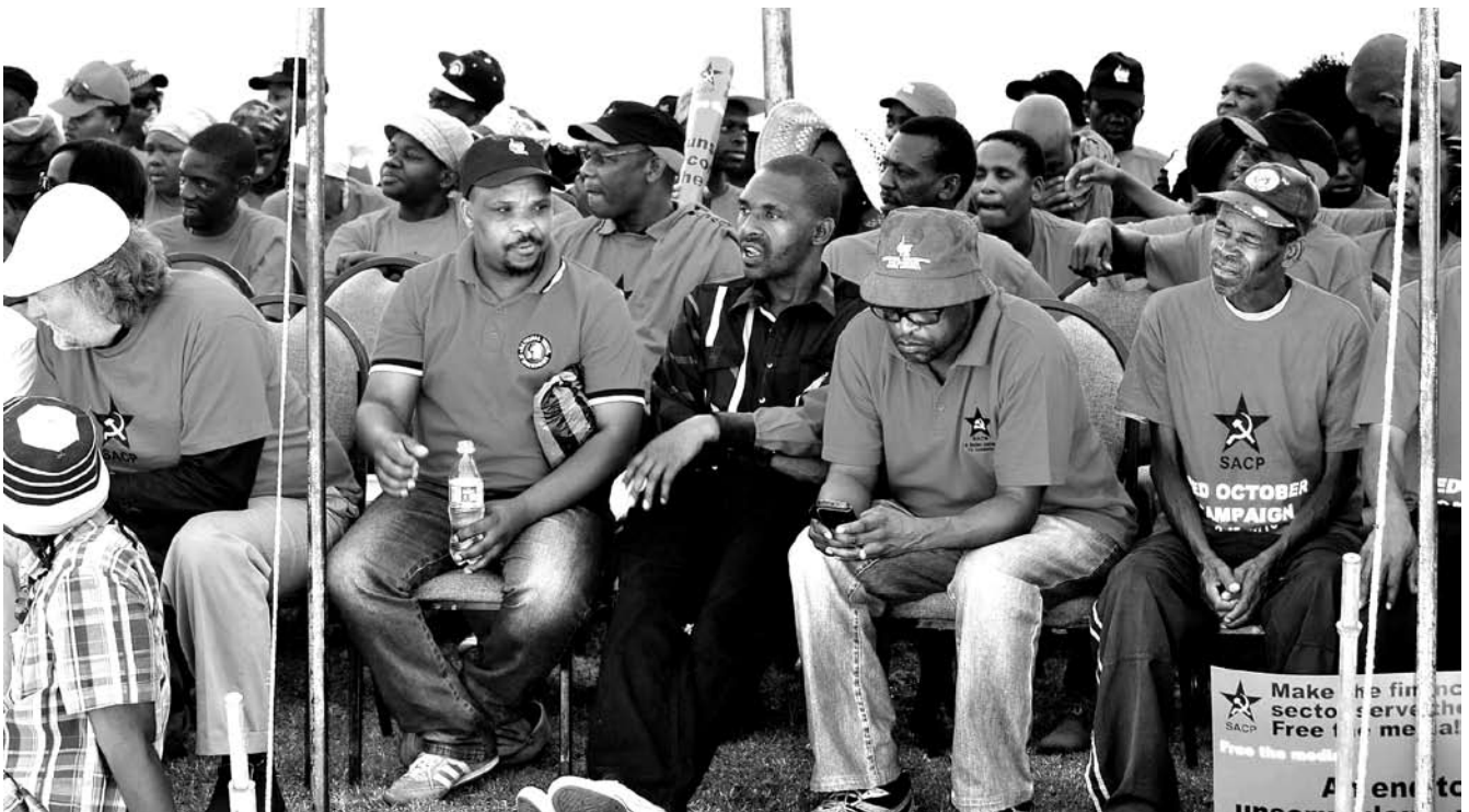
Kick-starting the Red October campaign: part of the crowd at the launch

is issuing a stern warning “to those who have developed a factional appetite to gamble with the unity of our movement and the Alliance! This only serves to delay and derail our national democratic revolution from achieving its historical mission.